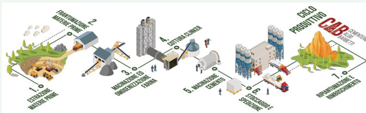
Figure 1 – The cement production cycle