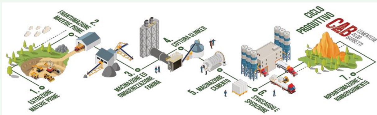
Figure 1 – The cement production cycle

Cement is a finely ground inorganic material composed of essentially different natural materials with a statistically homogeneous composition. It is a hydraulic binder that, when properly dosed and mixed with aggregate and water, reacts to form a progressively hardening mass. This mass is characterized by the ability to bind inert solids, such as sand and gravel, to form concrete mixes, premixes, and mortars, the basic components of every building structure.